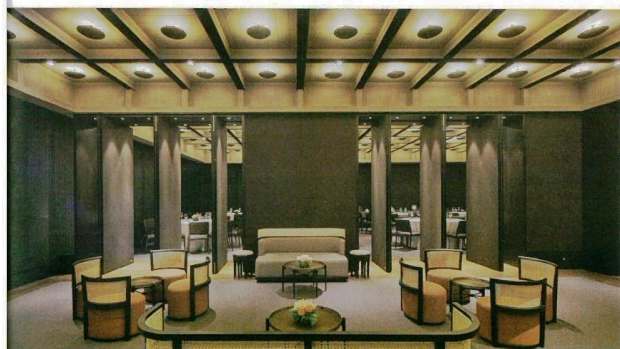
Bilik I and II are function rooms that are ideal for private dining, intimate team building events or presentations.