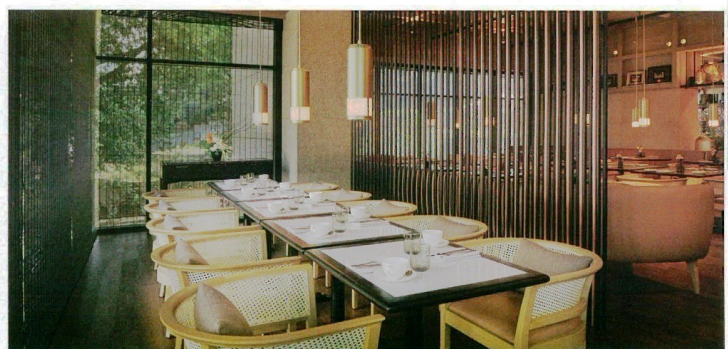
Atas Modern Malaysian Eatery is an all-day dining restaurant that offers a new yet distinctly Malaysian experience.

From social soirees to corporate meetings, The RuMa Hotel's conveniently located contemporary offerings are simply waiting to be discovered.