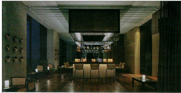
The Santal Pool Bar and Lounge is an oasis for relaxation, where guests can treat themselves to refreshments.