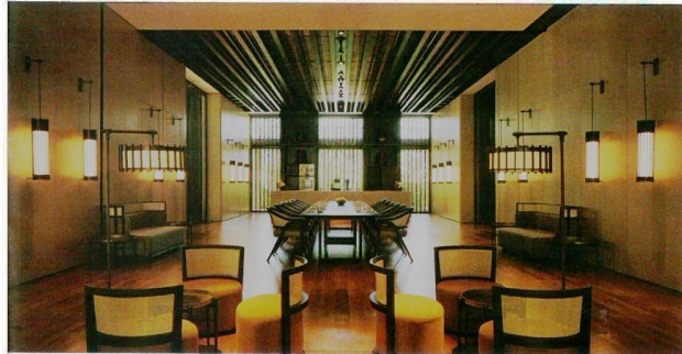
Overlooking the hotel's infinity pool and Santal pool bar is The Pavilion, which houses two rooms for personalised events.