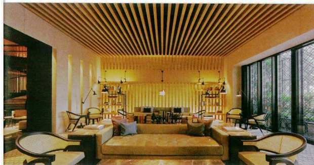
Guests can host afternoon tea parties or private cocktails at The Librari.