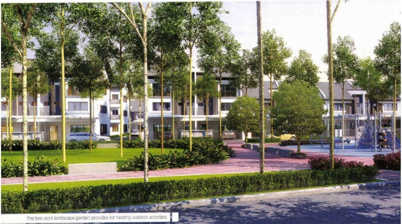
The two-acre landscape garden provides for healthy outdoor activities.