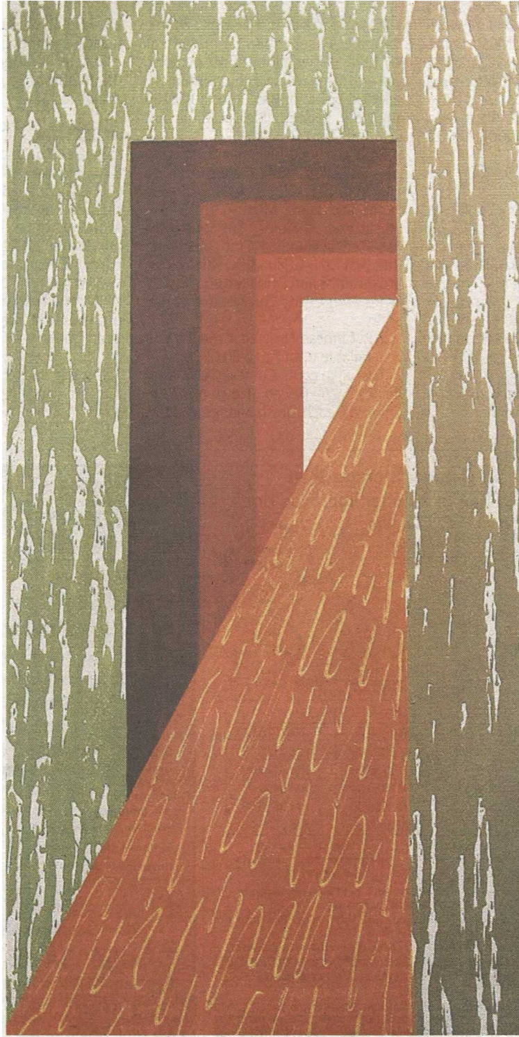
Step inside: Knock is part of Lim's Drip series. It gives the illusion of a 3-D look and shows the abundance of goodness flowing out from the door.