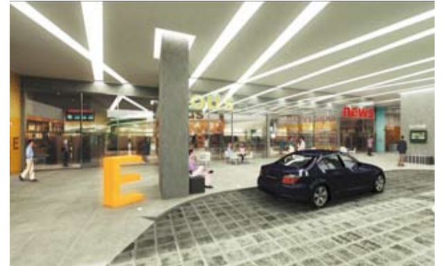
Artist's impression of drop-off and pick-up point for boulevard offices

1 Mont' Kiara, which is envisioned as the "first real integrated mixed development" in the prestigious Mont' Kiara address in Kuala Lumpur, will be a true manifestation of the "all in one" concept of contemporary living upon its completion by the second half of 2010.