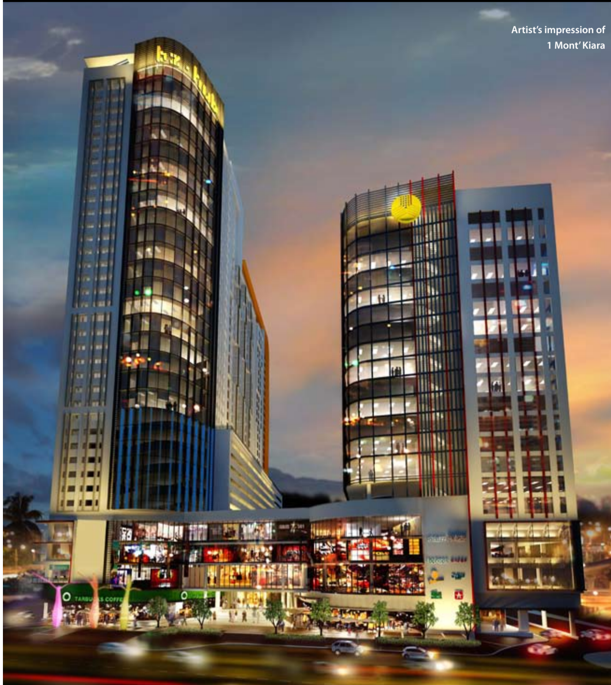
Artist's impression of 1 Mont' Kiara