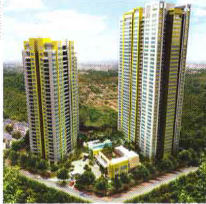
An artist's impression of Tiffani. The developer's target group is those who have made it and those who yearn for privacy.

Tiffani, which is slated for completion in July 2009, comprises three blocks — Kallista, Radiant and Ideale.