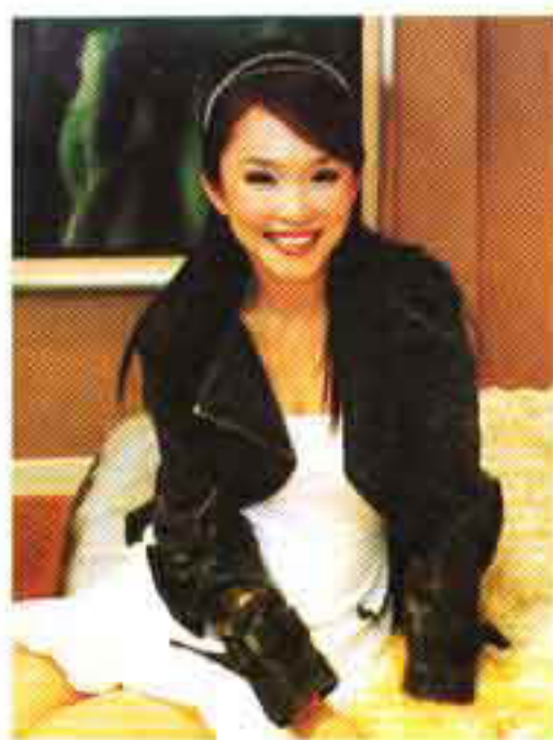
Fann Wong is one of Tiffani's two brand ambassadors

Tiffani comprises three blocks of 399 high-end condominiums, with prices ranging from RM230,000 (for a 815 sq ft unit) to RM4.6 million (the penthouse). The over 8,011 sq ft solitary penthouse will be sold to the highest bidder.